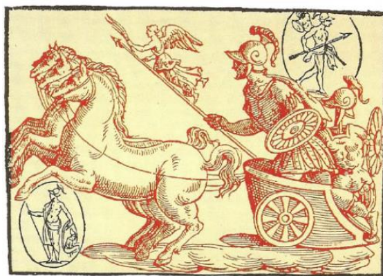
Figure 1: Mars, Roman God of War; Pic Courtesy Fontana 72.

Considering the importance given to speech as a referent to the supremacy of the Brahmin, born out of the mouth of Brahma, the mouth in the configured structure of the caste system naturally acquires a powerful positional symbolism where “the mouth gives judgment and so symbolizes the word” (Mitford 73). In fact, when we critically analyse the symbolism of the mouth as the egression to Brahminic (read divine/universal) knowledge, we realize that the whole machinery of the caste system is immanently rooted in a symbolic synthesis. Here the birth of the Kshatriya, the Vaishya, and the Shudra too are illustrative.