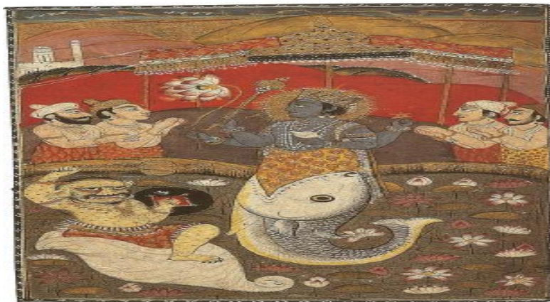
Figure 3: Vishnu issuing from the Mouth of a Fish.